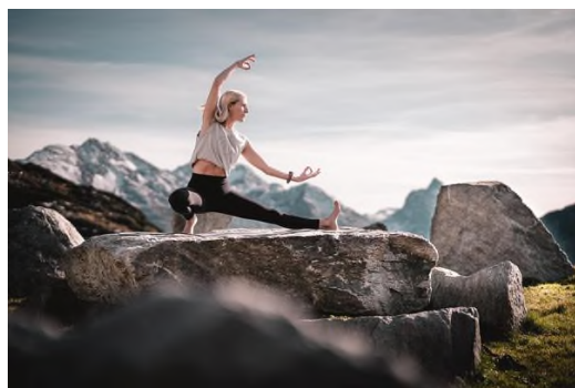
Photo ( download): "Mountains, People, Adventure" - Mount Patteriol on the Tyrolean side of the Verwall Group is emblematic of the motto of St. Anton Film Festival, which will once again bring movie-lovers and mountain sports enthusiasts together at Arlberg WellCom on the last weekend in August 2022.

The late summer get-together for outdoor film enthusiasts takes place annually under the motto "Mountains, People, Adventure". In 2023, movie lovers can look forward to the 26th edition of this event, with exciting screenings every evening from 20.00 hrs in the welcoming flair of the Tyrolean mountain community of St. Anton am Arlberg at Arlberg Wellcom. In addition to fascinating footage, extreme athletes and film directors talk live about their experiences and adventures and comment on the works being presented, with an award for the best film at the end. Ticket prices range from €12/pers (reduced evening ticket) to €44/pers (4-day festival pass). Official teaser on YouTube , while all stage guests and trailers of the individual films can be found on www.filmfest-stanton.at .